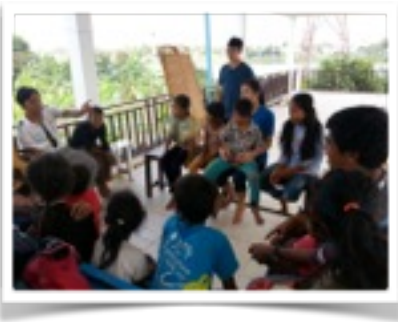
A blessed time with a group of children gathered for a time of ministry.

One other thing that struck me was the love God has for us, down to the individual. We had watched a documentary titled Father's Love the night before. One lesson that resounded in my mind was that we are to share our Father's love, and not condemn people. A missionary was reaching out to the transvestites in Thailand and he approached them with the Father's love despite the social stigma attached to transvestites. He shared with them about God's love and did not admonish them for what they were doing! The next morning, the only transvestite living on the island walked into the playground and hung around! Of all days - this morning! Of all places - here! We all stopped our breakfast and went to talk to him, sharing with him that Daddy in heaven loves him for who he is. We told him that he didn't have to put on a front when talking to Father, just share the pains and worries with Him! He allowed us to pray for him and we left knowing God has a plan for this man! Amazing! I am a vessel of God's love!