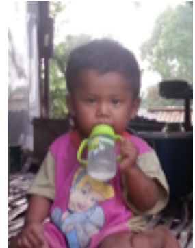
A toddler that was abandoned by his parents.

Another moment that impacted me was on the second day. After we had given the villagers a KFC treat, I told a mother that I would visit her and her boy who was having fever at that time. After the event, I went to her house and found out that there is another young boy that the family was taking care of. This boy had been abandoned by his parents, and he had been drinking water for 2 days because the family taking care of him did not have enough money to buy any milk powder for him. Then again, I felt the heart of God the Father for this boy and I asked one of the translator to help me get a tin of milk powder for that boy.