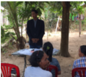
Pastor sharing God's word on Sunday morning with his congregation