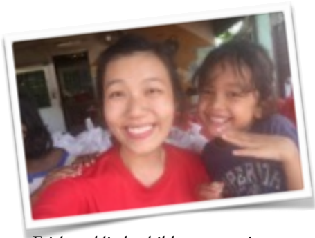
Faith and little children preparing to distribute food to the villagers