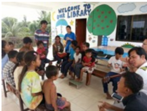
Sharing with the children

We had many opportunities to spend different pockets of time with the children, male youths and also the female youths. Each time we met with the different groups, we saw how God used us to restore hope in their hearts and share His love with them. Some of the children even prayed for their friends and prophesied to their friends. We saw how God is raising up these children to be that voice in Cambodia, preparing the way for Jesus' return.