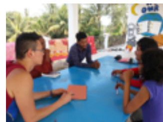
Meeting with Pastor and church leaders