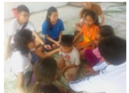
Praying for a boy with down syndrome and his sister behind him