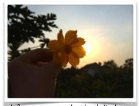
A flower grown on the island, displaying the beauty of its creator