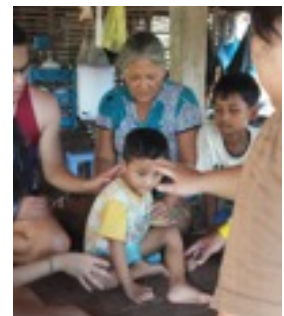
Praying for a child.

The first day began at 7am, we woke up, washed up and got ready for breakfast. After that we did devotion and talked about what we wanted to achieve in this mission trip. I felt that since I was already here, why not just make the best out of it. I shared with the group that I came here to grow closer to God ( Maybe I would be able to experience God working here, just maybe ). After devotion, we went for a prayer walk around the island, and visited a family with a kid who had cerebral palsy; he had cross-eyed eyes and he could not walk properly. We prayed healing over him and left, then we went back to the school (the place that we were living in) and had lunch. As the first day passed, I felt gloomy. I still did not like the place, I was not sociable with the kids and I just ignored everyone that passed by. On the 2nd day, God struck my heart as we had a short sharing to the kids in the school. We told them to draw pictures of what they thought of God. When I was looking through the photos, I saw that they were so in love with God, some of them wrote "I love God", while others wrote "Jesus Loves the Little Children". It struck me that if these kids could experience God's love and love God, why couldn't I? We bought KFC for the families that day, and Kor