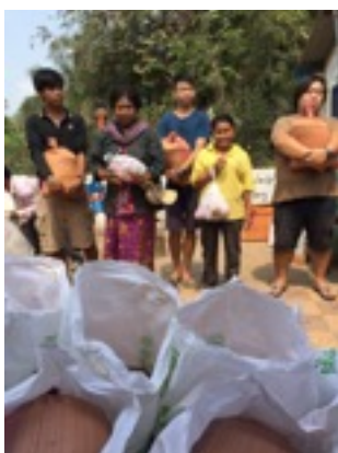
Distributing 10kg of rice, 1 bottle of preserved tofu and 5 cans of sardine to 141 families