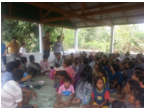
Sharing from the Word of God before lunch

On the afternoon of the fourth day, we distributed food packages to the 114 families on the island. The 5 of us spent a whole night repackaging 25 bags of 50kg rice sacks into 10kg packs to be distributed. God sustained us as it was more difficult and back breaking than we thought it would be.